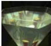
Thermal mass tubes