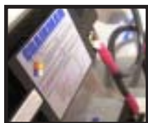
Concord 12 volt deep cycle battery