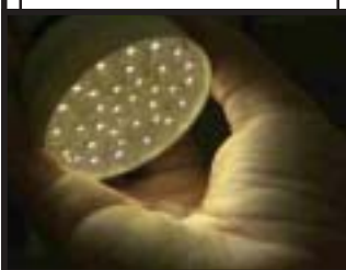
Light Emitting Diode (LED)