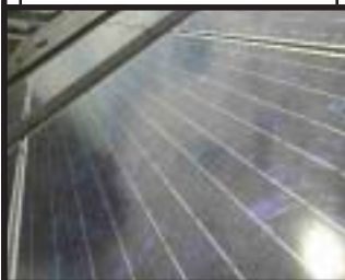
BP 31605 Photovoltaic Panels used on Auburn Solar House